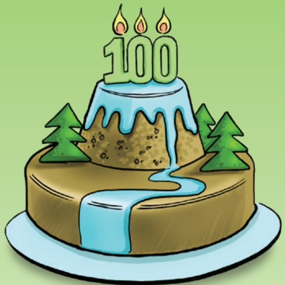
Cake showing an environment/habitat