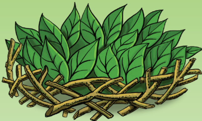
Cake made from nature