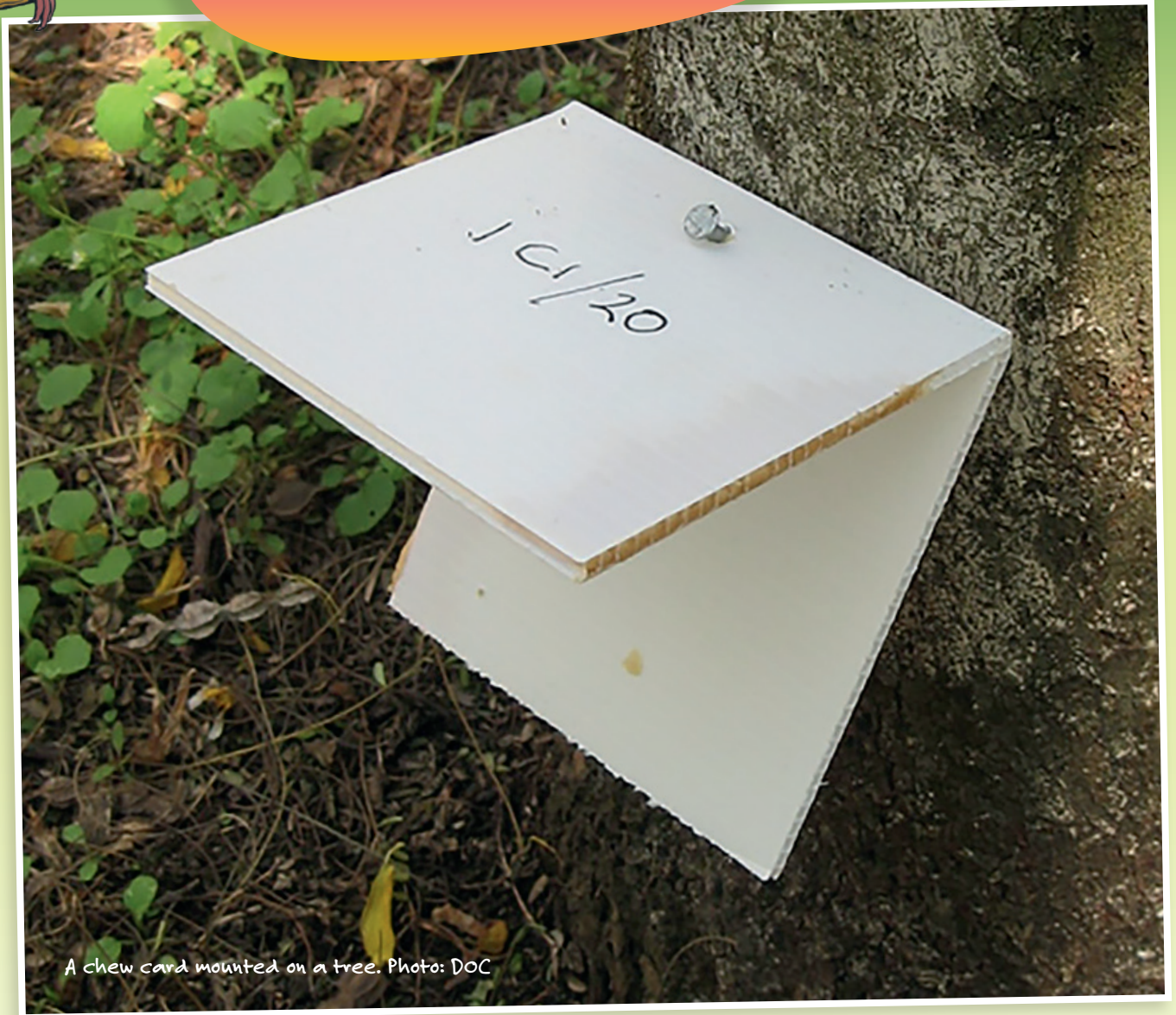
A chew card mounted on a tree.

© Wild Things Issue 148, August 2020. Produced by Forest & Bird