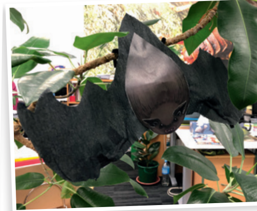
Getting ready to fly!