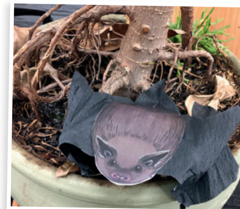
Foraging on the forest floor