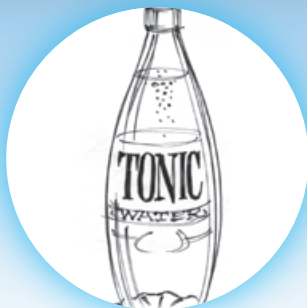
1 cup of tonic water