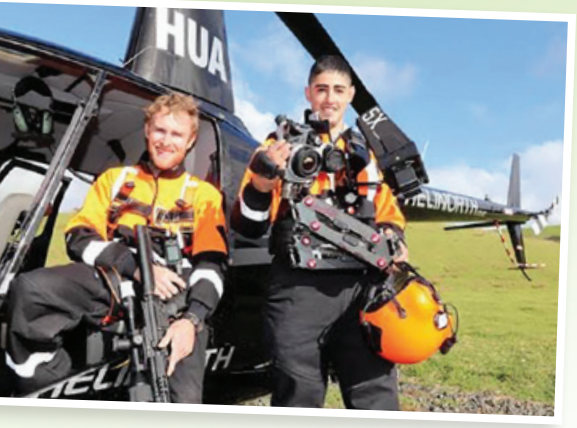
With our thermal imaging system. It's a special type of camera that "sees" heat rather than light.