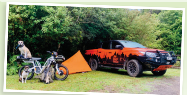
some of our vehicles.

When we are hunting on the ground, we have our dogs by our sides and a pack with food, survival equipment, ammunition, and a knife in it. We work in the daytime and night-time for about eight hours at a time (that's two hours longer than a day at school). Depending on the job, we might hunt as individuals, pairs, or a team.