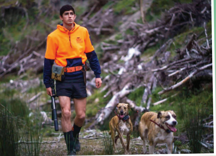
Me with the dogs.