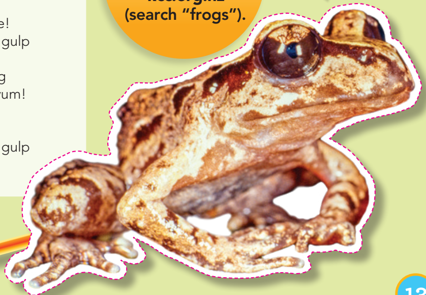
Hochstetter's frog.

Make your own 2D frog cut-outs, or find ours on kcc.org.nz (search "frogs").