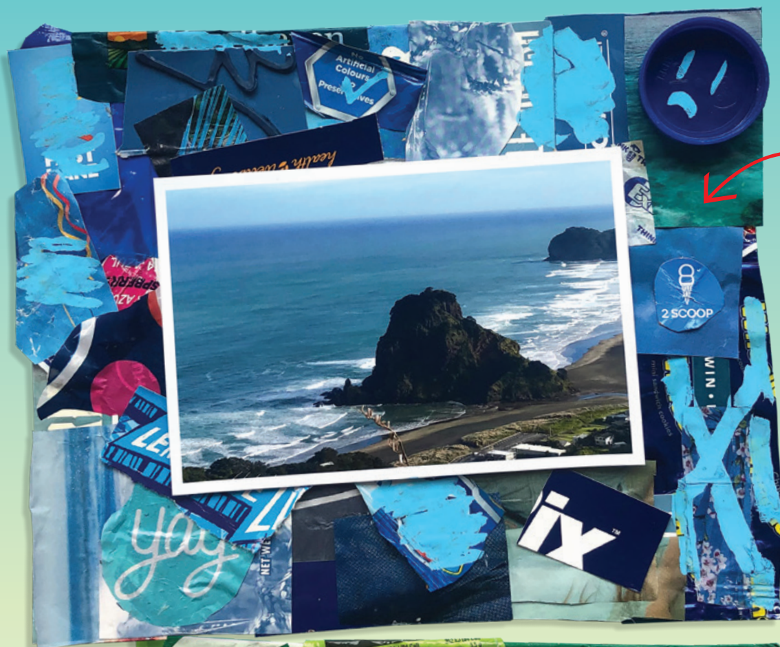
"This is my dad's favourite beach - Piha."