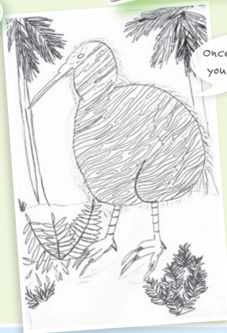
Alex thinks our mascot should be the great spotted kiwi – it is nationally vulnerable.

Our new biodiversity mascot will be announced in Wild Things , Issue 135, Takurua | Winter 2017. Entries close 30 April 2017. Voting closes 13 May 2017.